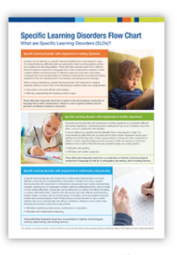
AUSPELD Specific Learning Disorders Flowchart