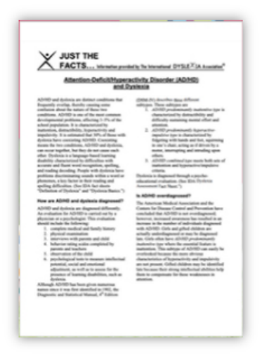
International Dyslexia Organisation: Fact Sheets