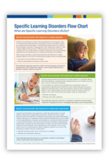
AUSPELD Specific Learning Disorders Flowchart